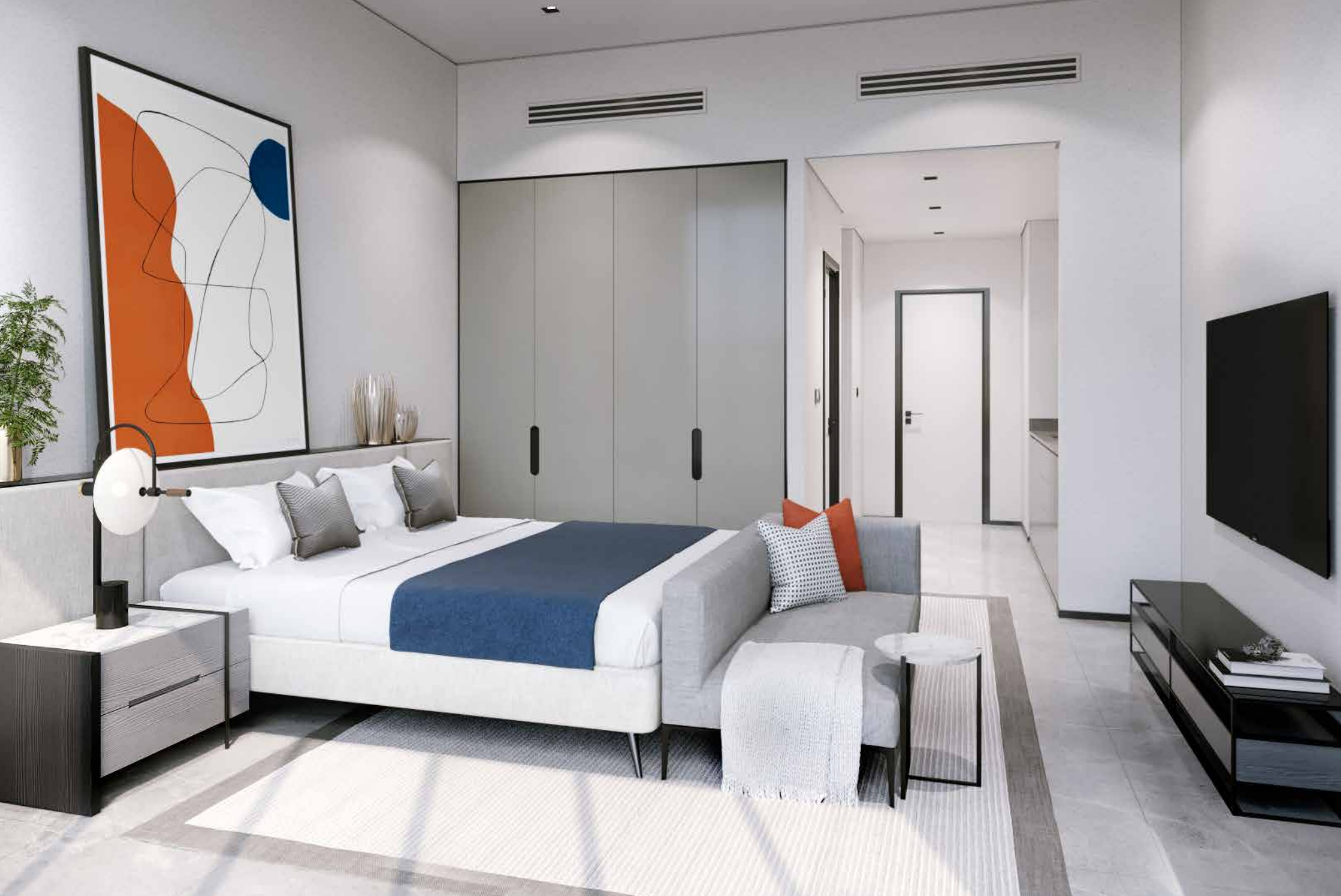
EPITOME OF URBAN LIVING THE FUNCTIONAL STUDIO