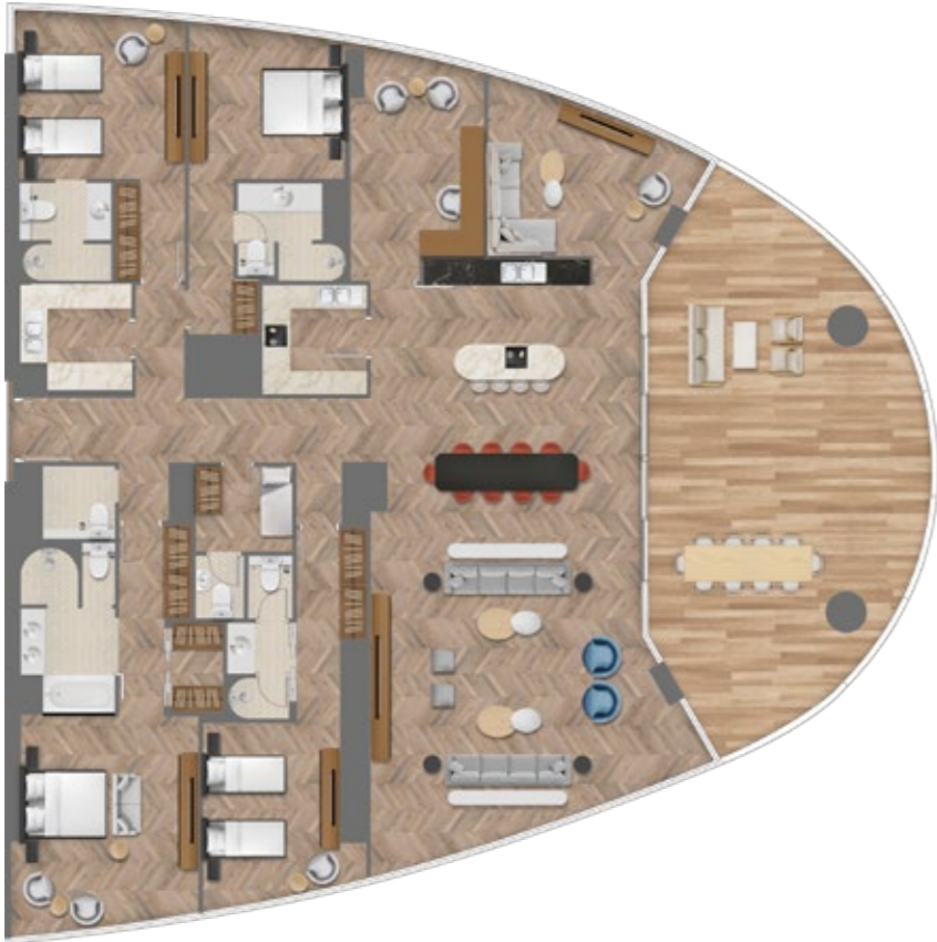
4 BEDROOM APARTMENT, TYPE A