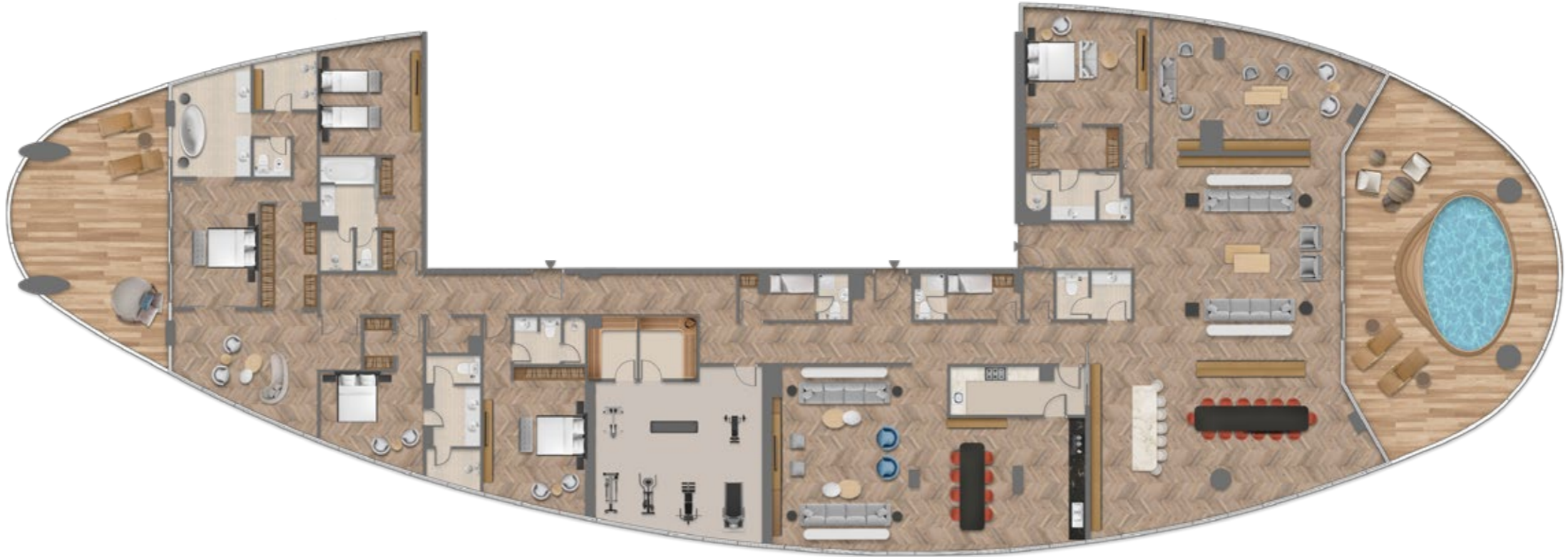
5 BEDROOM FULL FLOOR PENTHOUSE