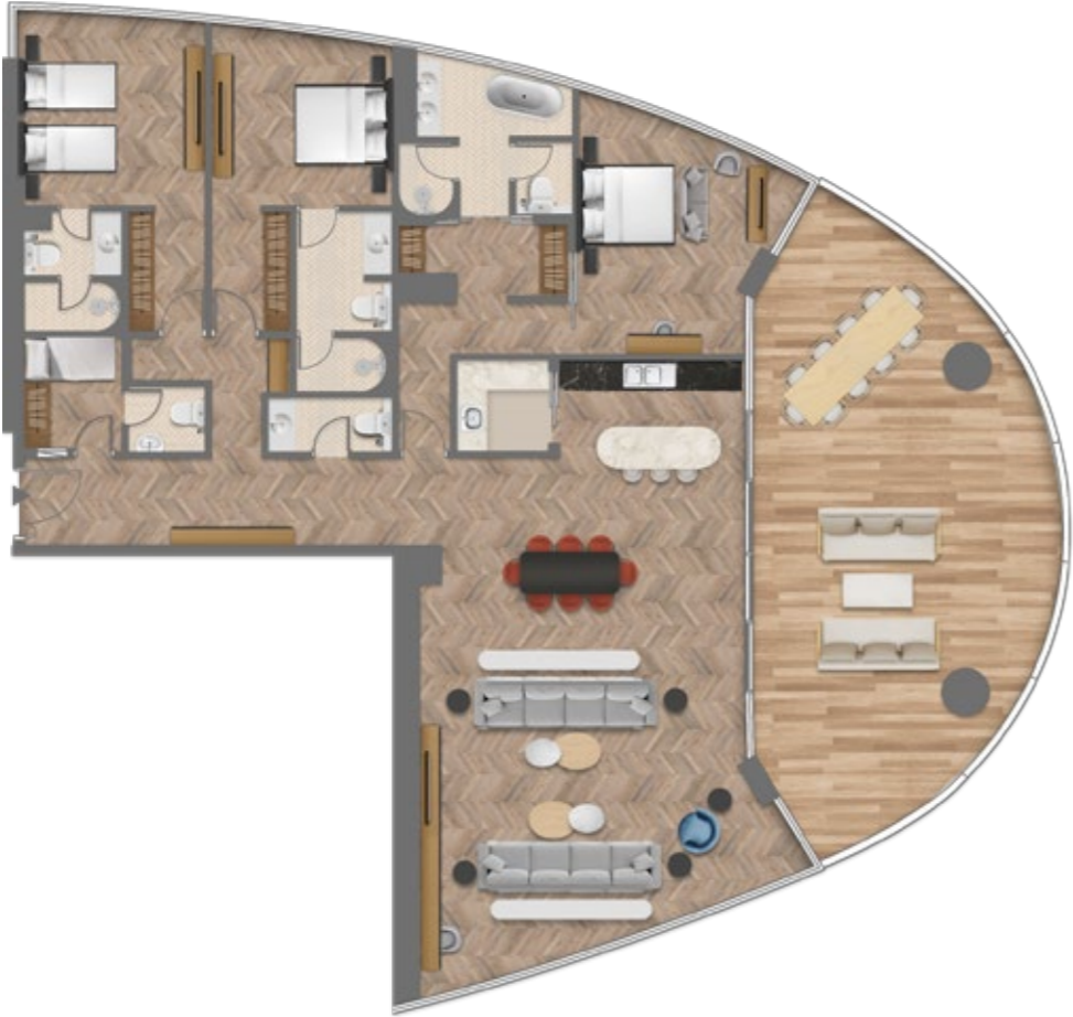
3 BEDROOM APARTMENT, TYPE B