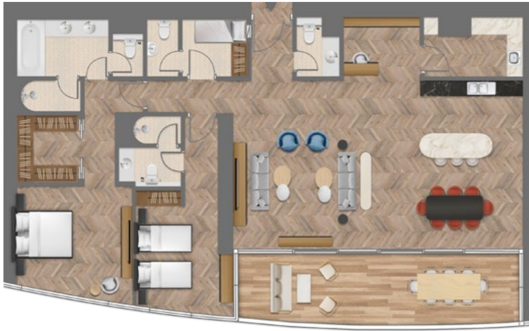
2 BEDROOM APARTMENT, TYPE C