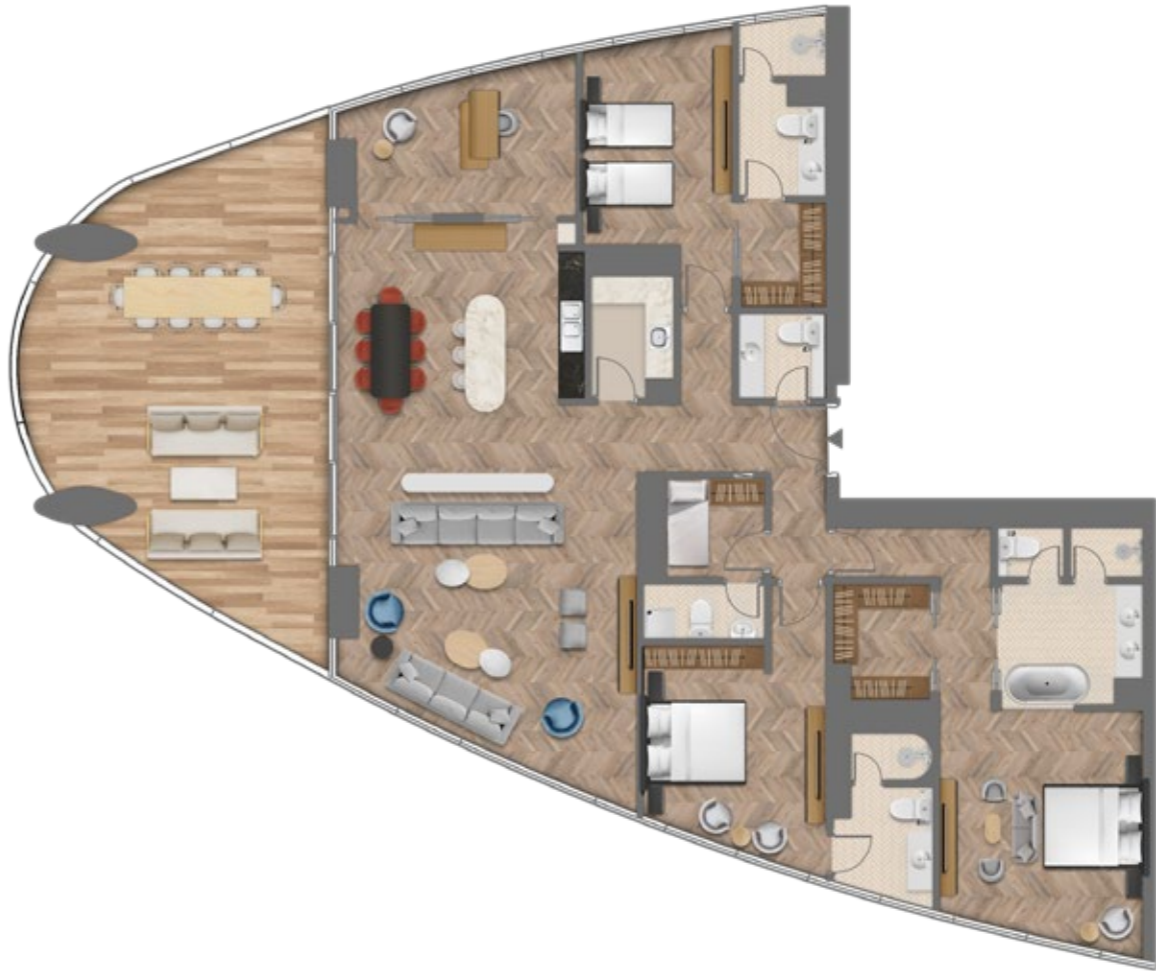
3 BEDROOM APARTMENT, TYPE A