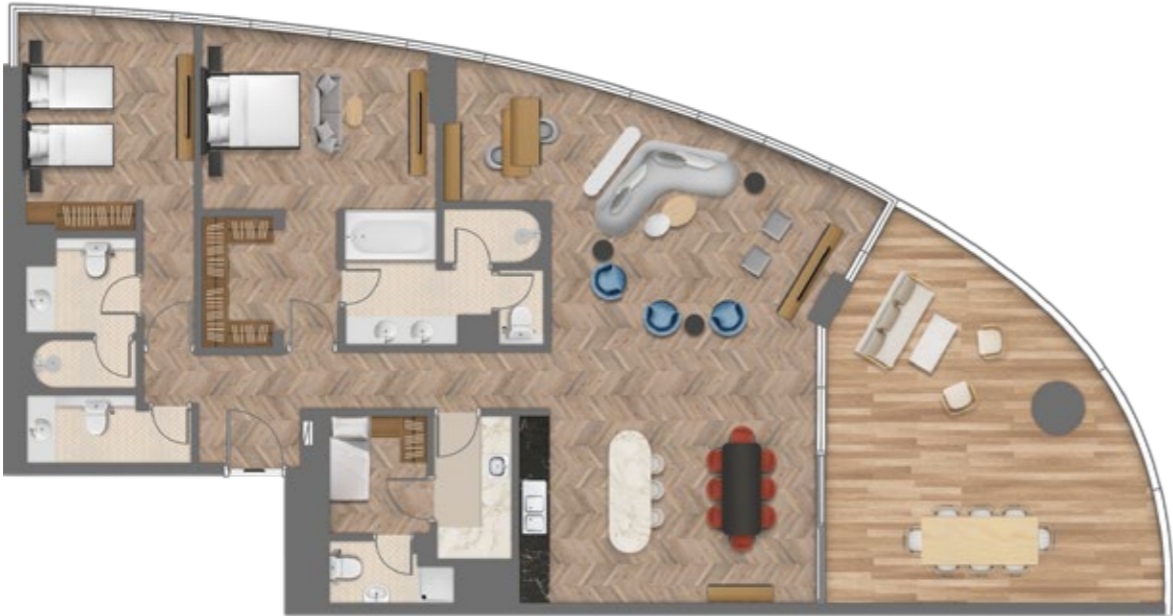
2 BEDROOM APARTMENT, TYPE A