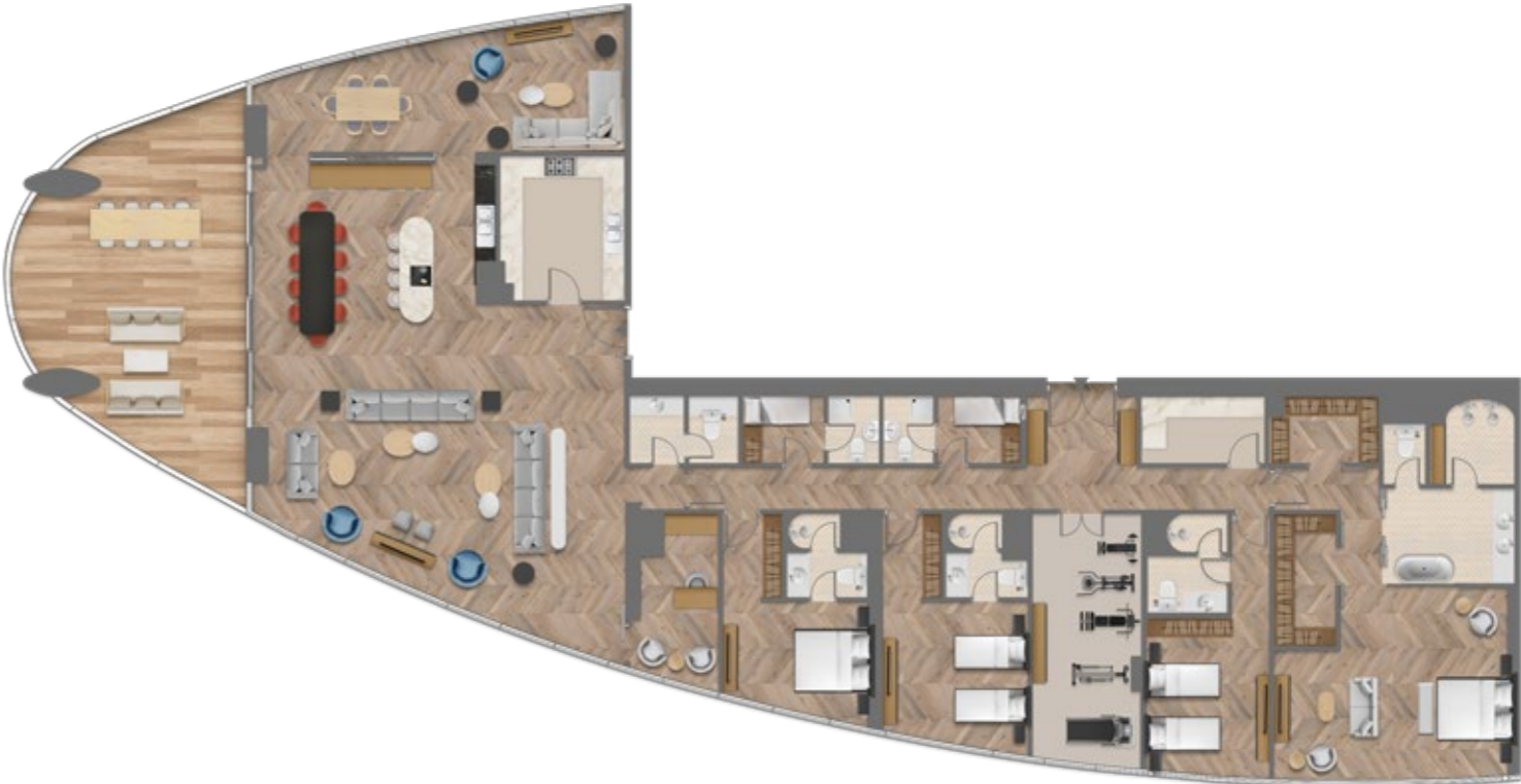
4 BEDROOM APARTMENT, SIMPLEX