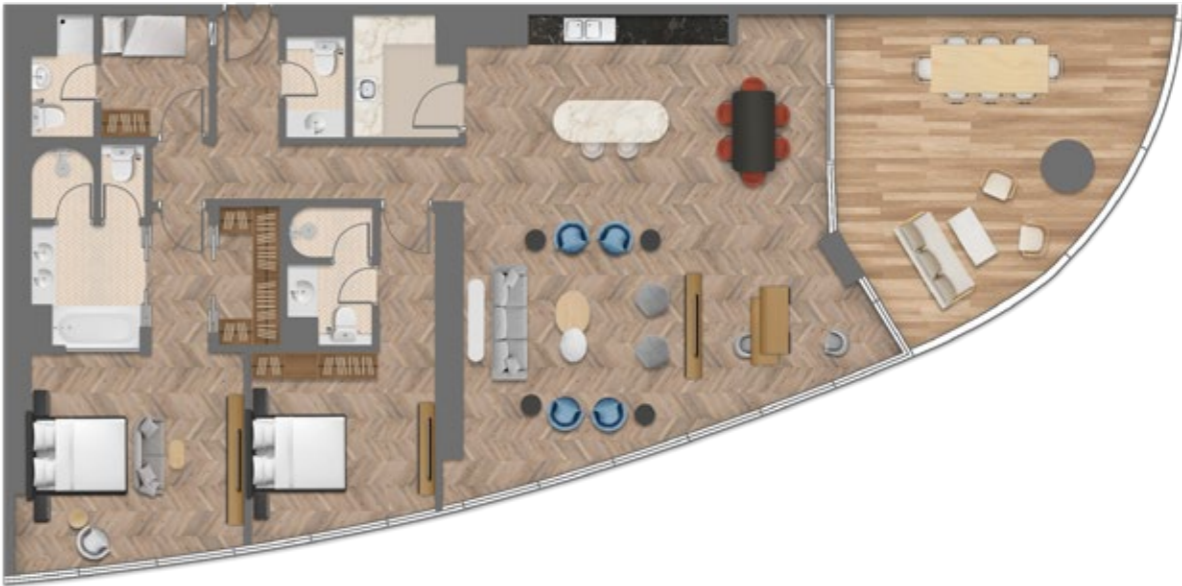
2 BEDROOM APARTMENT, TYPE B