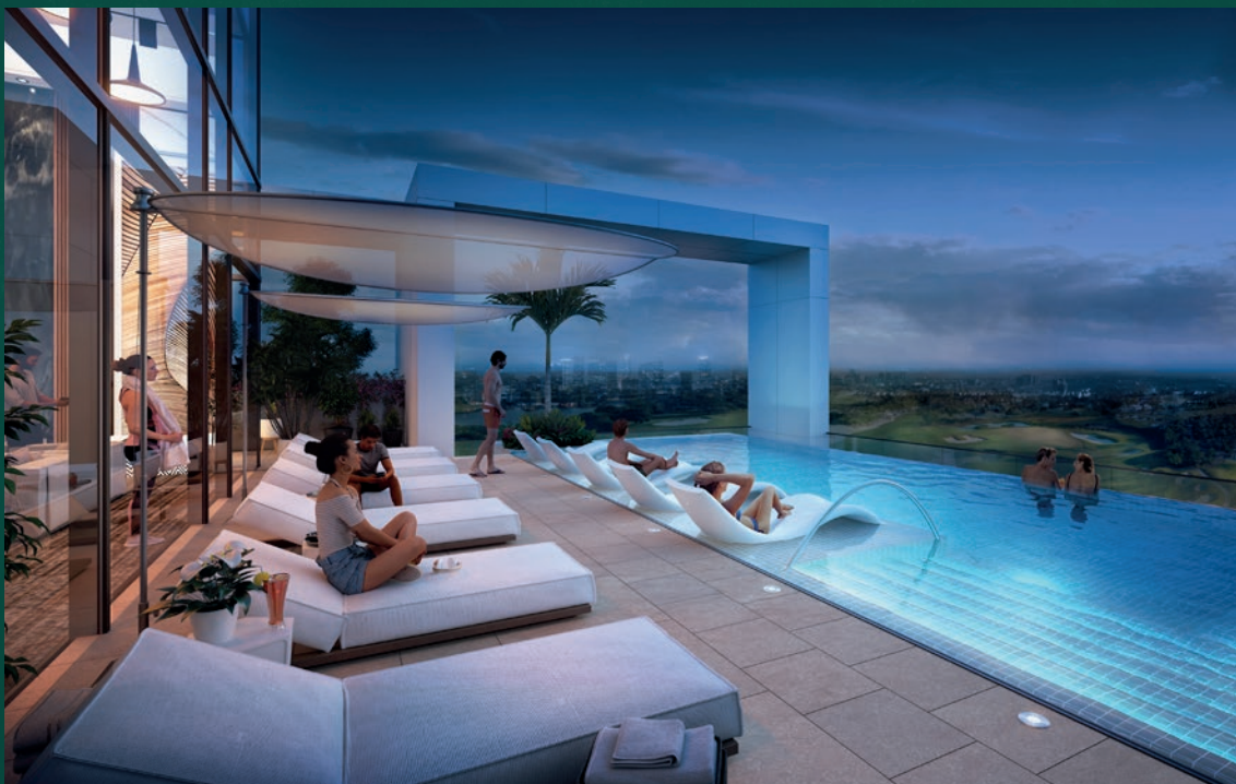
Infinity Edge Pool