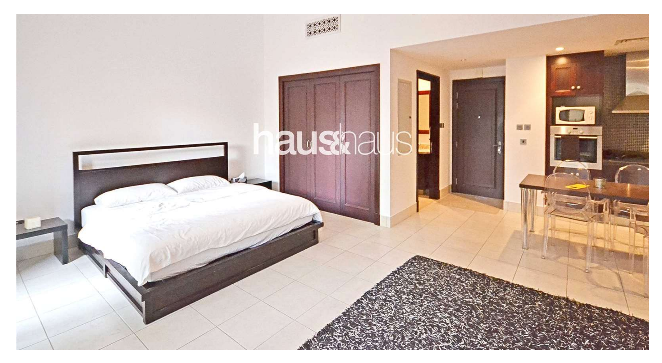
Reehan 2, Old Town