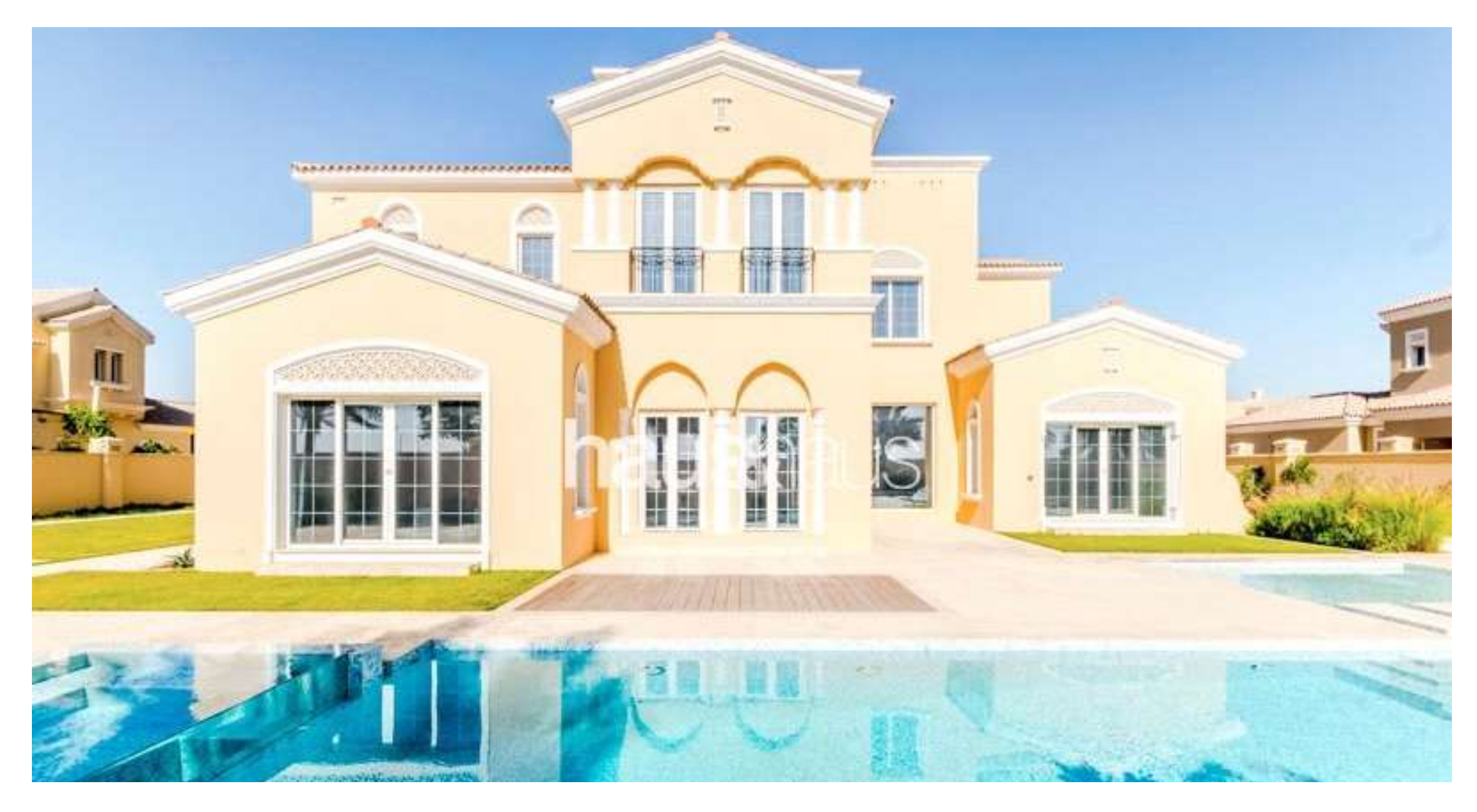
Polo Homes, Arabian Ranches