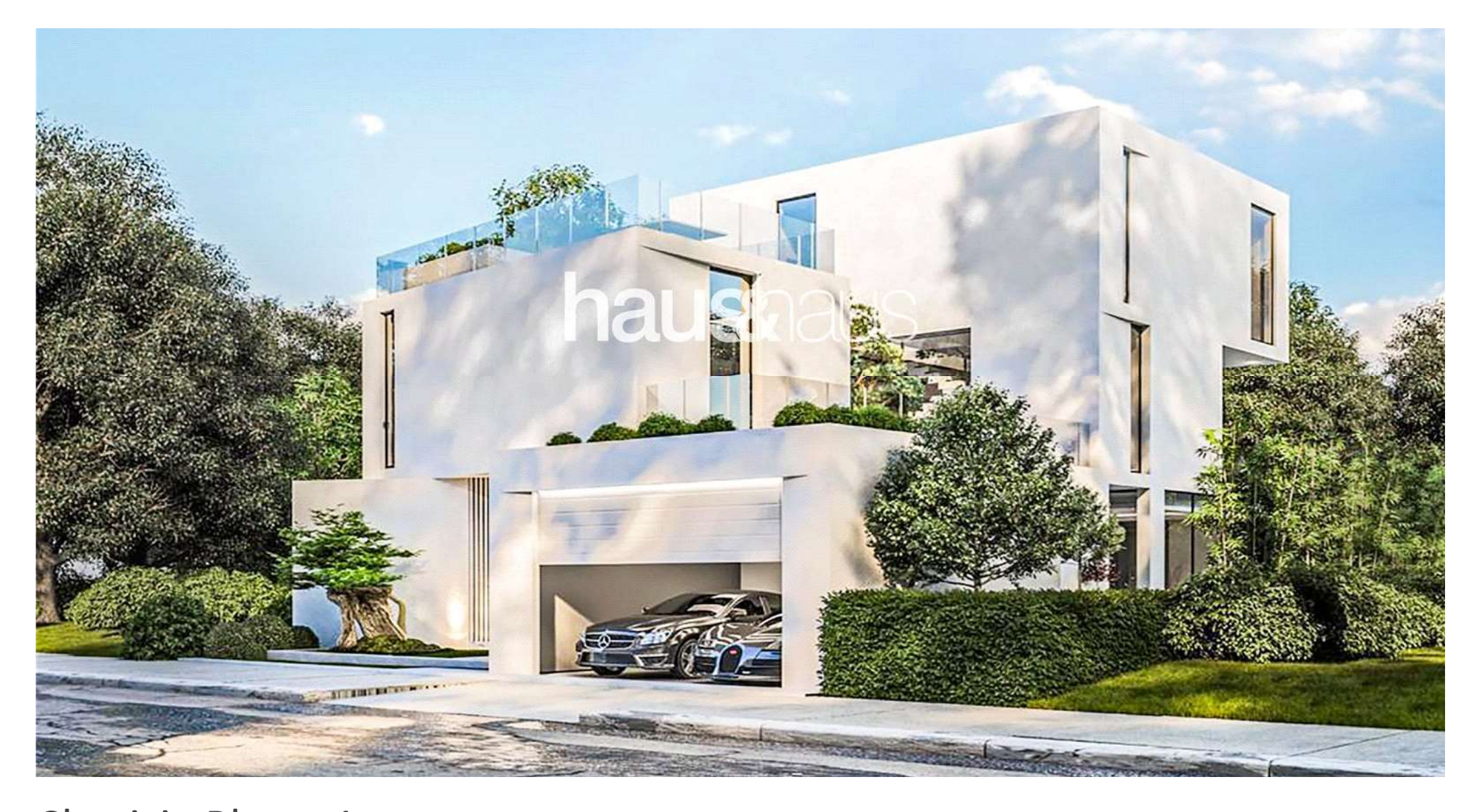
Chorisia Phase 1, Al Barari