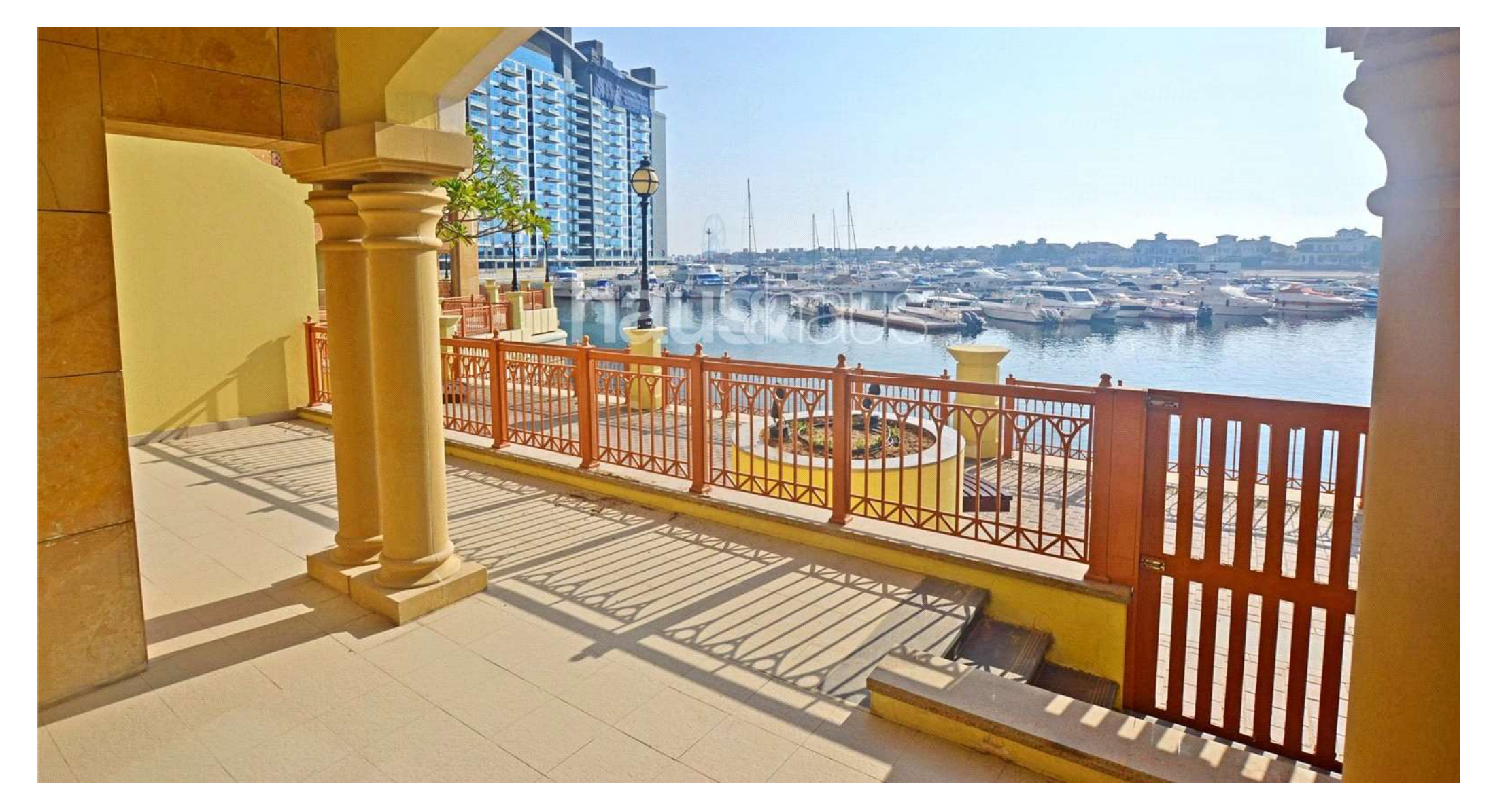
Marina Residences 2, Palm Jumeirah