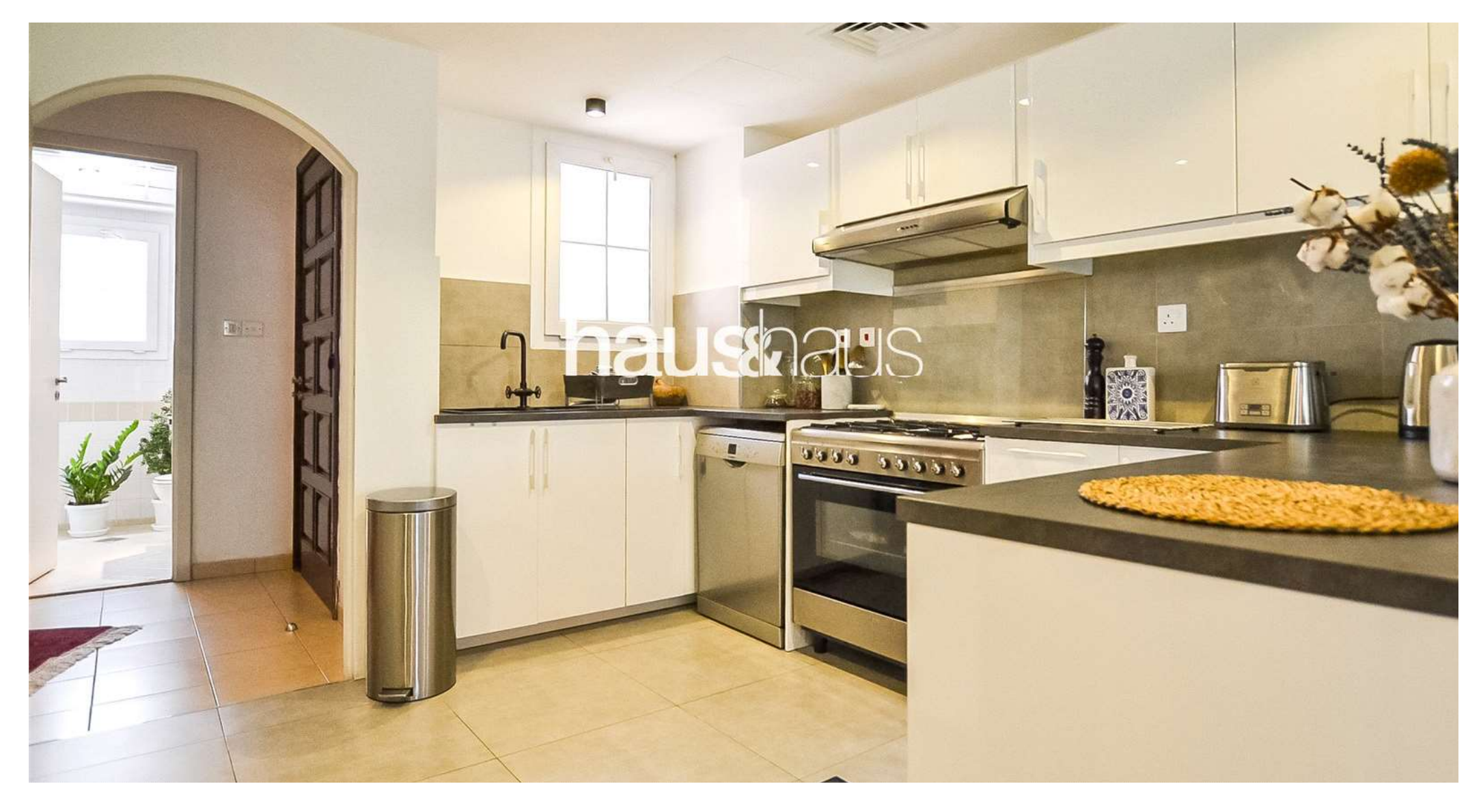
Al Reem 1,