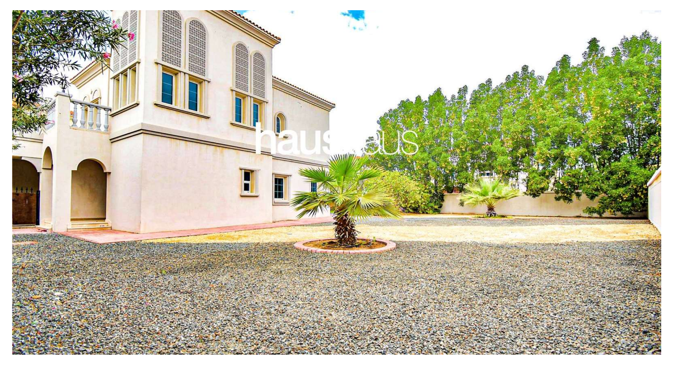
Mediterranean Villas, Jumeriah Village Triangle