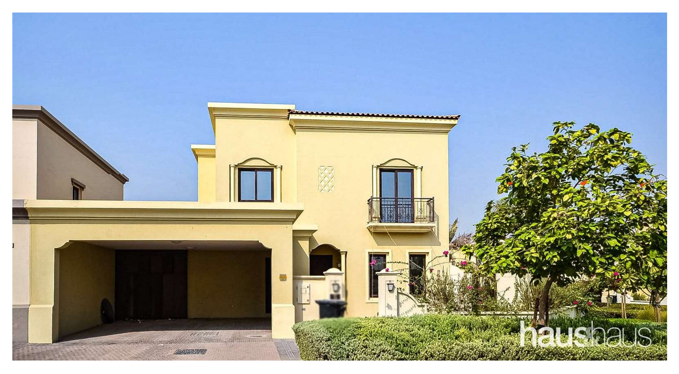
Lila, Arabian Ranches 2