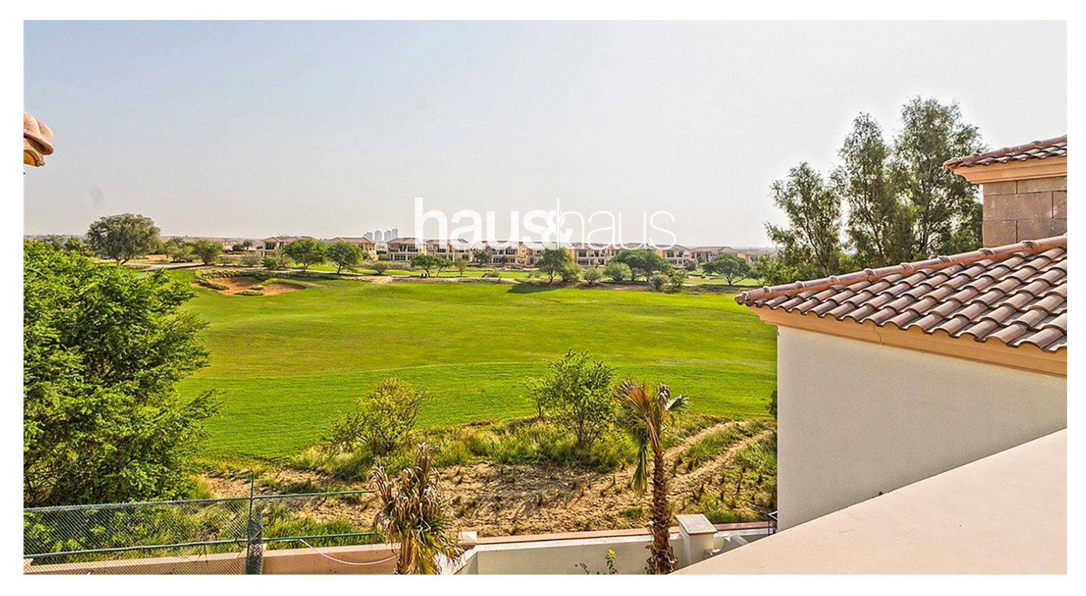
Redwood Park, Jumeirah Golf Estates