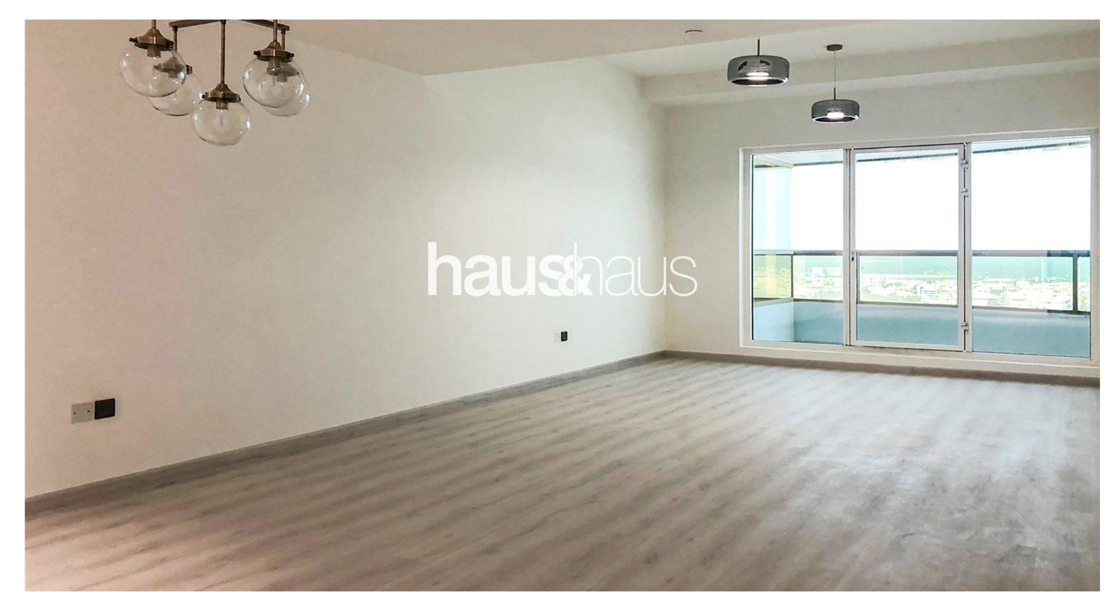
Al Manal Tower, Sheikh Zayed Road