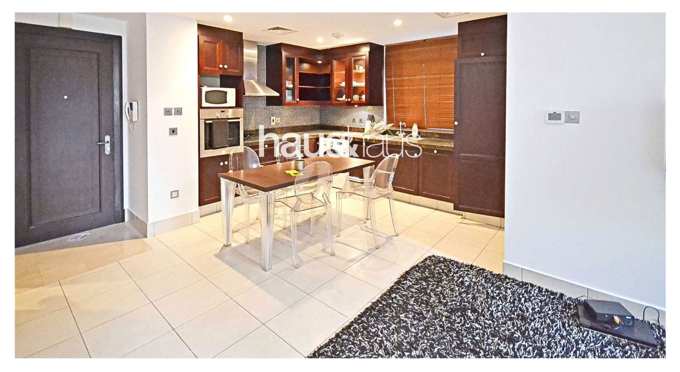
Reehan 2, Old Town