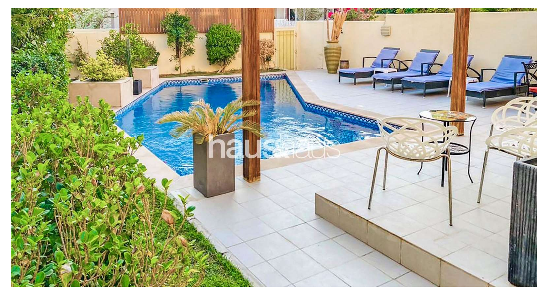
Springs 11, The Springs