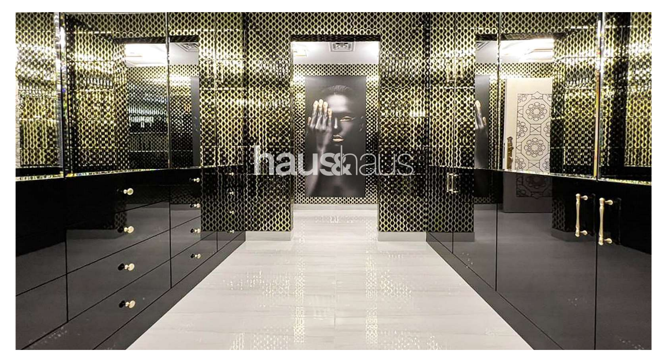
Goldcrest Views 1, Jumeirah Lake Towers