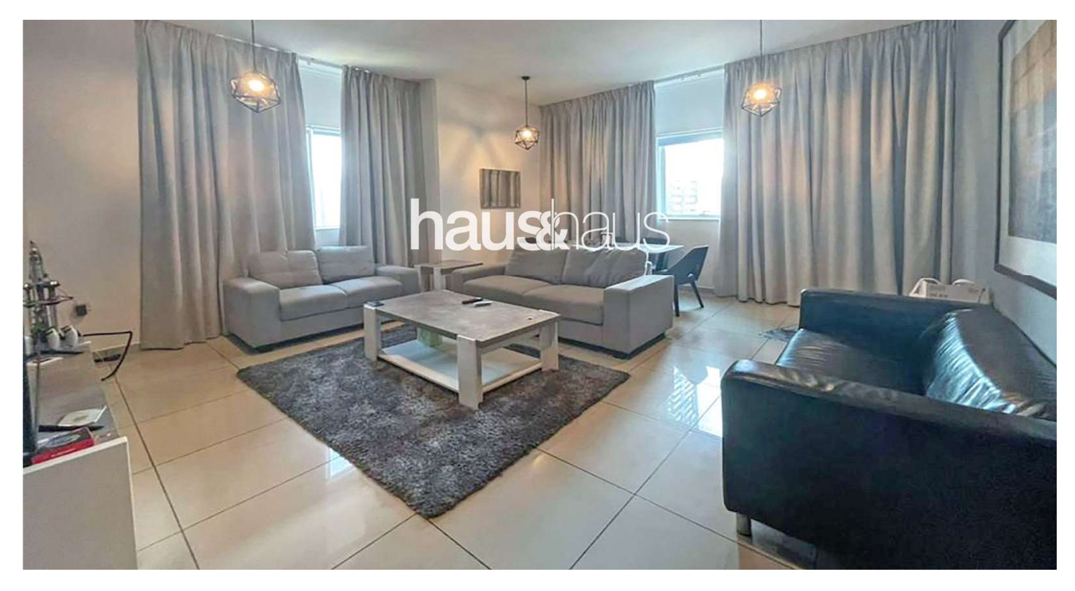
Marina Pinnacle, Dubai Marina