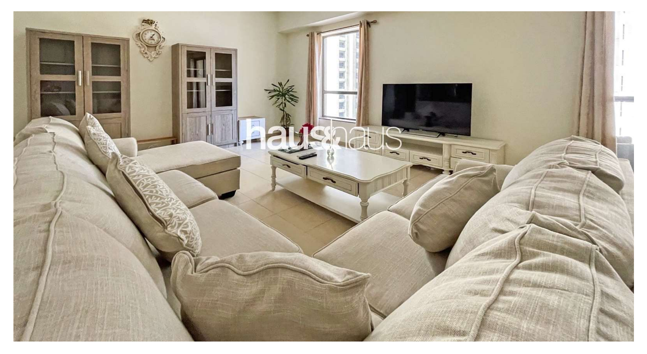
Rimal 2 Jumeirah Beach Residence