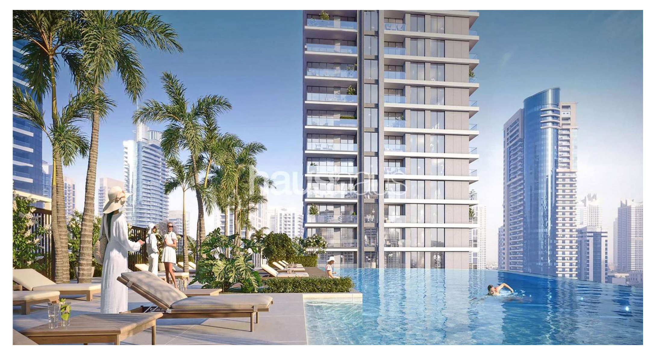
Marina Shores, Dubai Marina