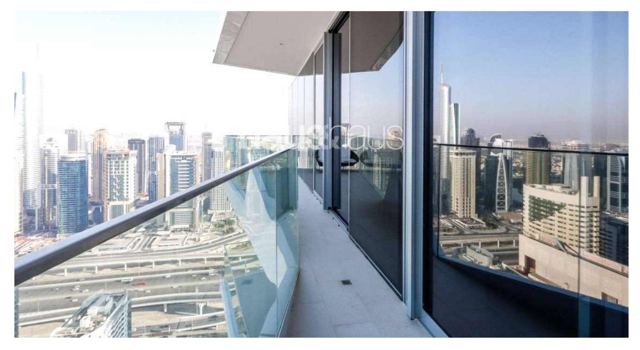
Stella Maris, Dubai Marina,